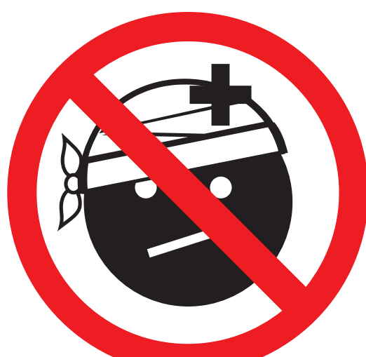
Recent Surgery or Illness

Do not ride if you have any of the following conditions