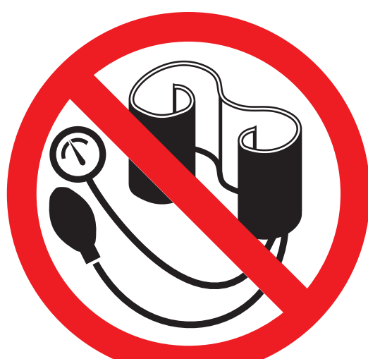
High Blood Pressure or Aneurysms