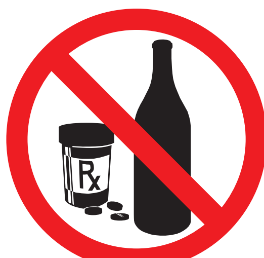
Under the influence of Drugs or Alcohol

For your safety, you should be in good health to ride. Only you know your physical conditions or limitations. If you suspect your health could be at risk for any reason, or you could aggravate a pre-existing condition of any kind, DO NOT RIDE!