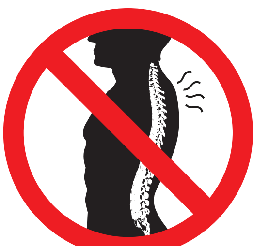
Neck, Back or Bone Ailments